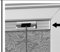
Minimum Headrail Depth Mount inches (cm)

Fully recessed headrail in window casing/molding